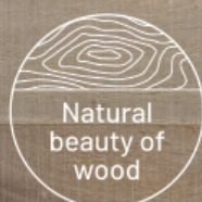
Image represents 1.8m 2